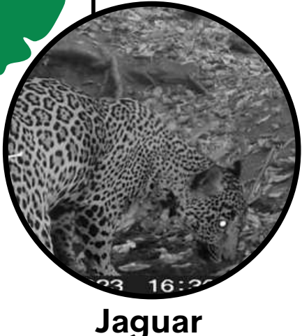
Jaguar by @mauroaguirre Sinaloa, Mexico Endangered