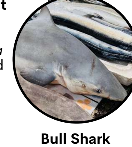
by @timashtree Ko Samui, Thailand Vulnerable, from local fresh market showing impact of fisheries over ecosystem.

Nairobi, Kenya Near threatened with only 348 observations on iNaturalist.