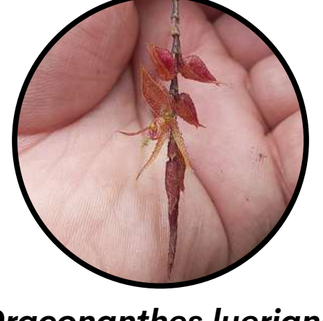
Draconanthes lueriana La Paz, Bolivia

Small epiphytic orchid of the very humid forests of the Yungas. Endemic to Bolivia, previously known only from Cochabamba.