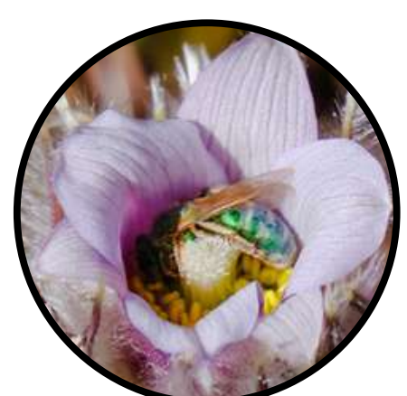
Texas Striped Sweat Bee